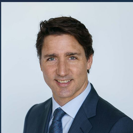
JUSTIN TRUDEAU 23RD PRIME MINISTER OF CANADA

I am pleased to extend my warmest greetings to everyone taking part in the 2025 John Molson Undergraduate Case Competition, presented by the John Molson School of Business at Concordia University in Montreal. Since the inaugural event in 2009, this competition has grown every year, to become the largest international business case competition. The format provides an opportunity for business undergraduates to put their problem-solving and critical thinking abilities to the test in a business case competition that is both challenging and exciting. As they vie for a place in the final round, students hone important professional skills and develop confidence while benefiting from the evaluations of adjudicators chosen from leading Canadian businesses.